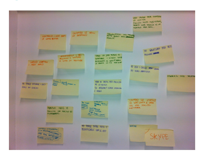
Fig. 1 - Post-it stickers exercise

the sampling strategy (due to country variations, e.g., different school cultures and different procedures to go through schools, etc.).